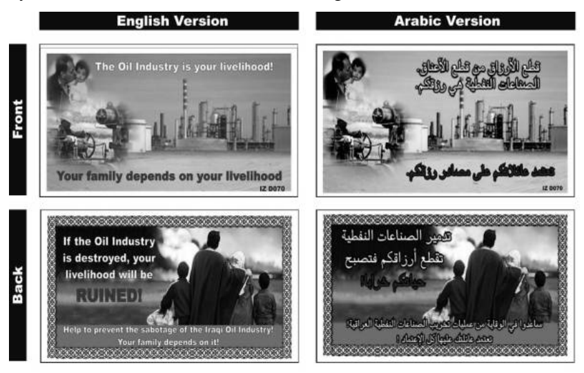
Figure 4 Operation IRAQI FREEDOM Leaflet (IZD-070)

was also credited with saving the Iraqi oil fields from destruction. Although many of the oil wells were booby-trapped with explosives, the valves were switched off to minimize damage to the oil fields because as one Iraqi oil official explained, "We read your leaflets. We heard your broadcasts. We understand that keeping the oil infrastructure was important for our future. And so while we complied for our own protection with the regime, we ensured that true damage to the oil fields would not occur." As these examples show, information warfare, specifically psychological operations, had a significant impact on the conduct and outcome of this interstate conflict. Without the use of information warfare there could have been a greater attrition of Iraqi forces and an ecological disaster if the oil officials carried out Saddam Hussein's orders to destroy the oil fields. However, the salient point is that these psychological operations efforts began well before the start of armed conflict and could be made illegal by an information warfare arms control regime. In fact, coalition