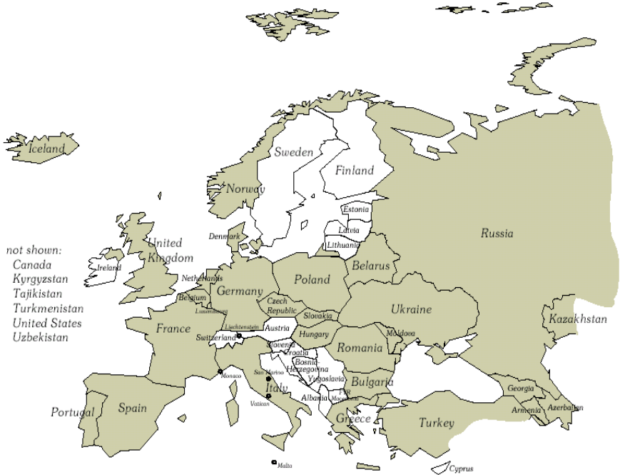
Chart 2: Map of CFE and Non-CFE countries in Europe 60

The Treaty on Conventional Armed Forces in Europe (CFE) remains the largest and, therefore, the most important conventional arms control treaty ever negotiated. The following map shows the signatories to the treaty.