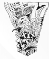
USAF Academy Class of '77