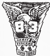
USAF Academy Class of '83