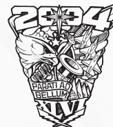
USAF Academy Class of '04