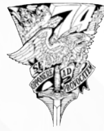
USAF Academy Class of '74