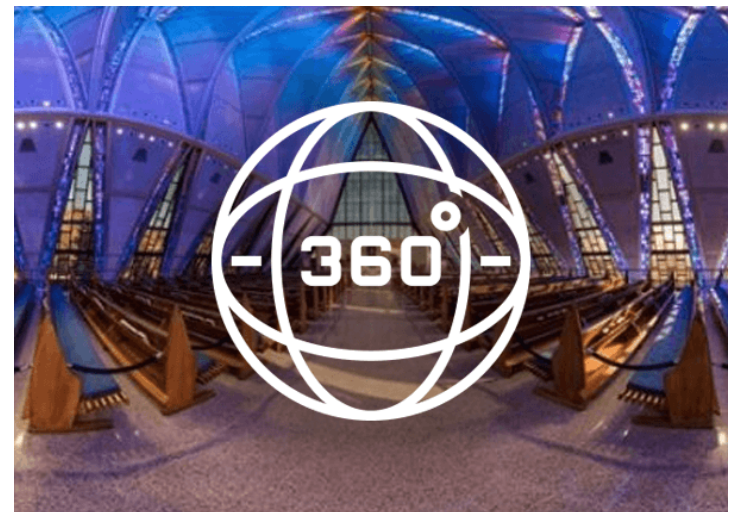
Public Affairs staff report, May 2, 2019

U.S. AIR FORCE ACADEMY, Colo. — So you want to visit the Academy but don't feel like leaving home?