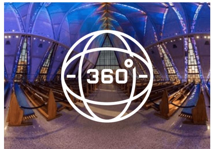
Public Affairs staff report, May 2, 2019

U.S. AIR FORCE ACADEMY, Colo. — So you want to visit the Academy but don't feel like leaving home?