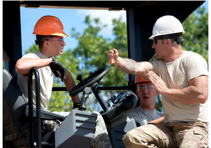
June 21, 2019

This program supports the development of cadets as future officers and leaders. Nearly fifty percent of Academy's cadets are selected to attend pilot training after graduating.