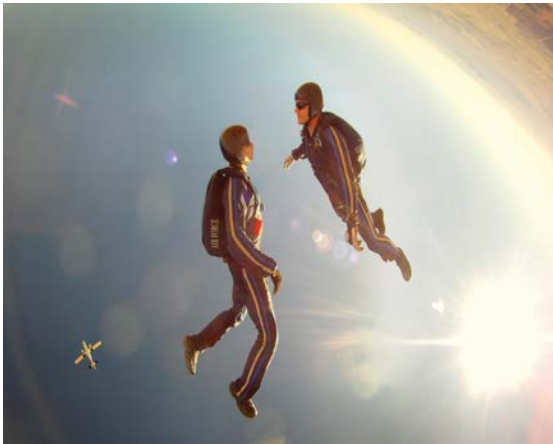
Staff report, June 3, 2019

"Cadets, it's not lost on me that I'm the last thing standing between you and your summer leave," she said.