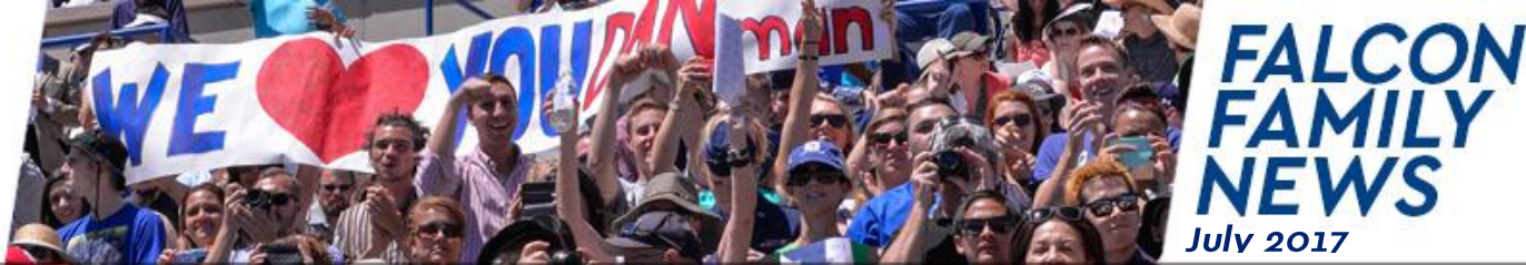
PHOTO ACCESS FOR PARENTS -

The U.S. Air Force Academy Public Affairs office provides command information to the installation and the public. One of the ways we do this is through social media venues such as Facebook, Twitter, Instagram and YouTube. All information provided is official, but there is also fun stuff on there too. Did you know you can download photos from our Facebook page for free?