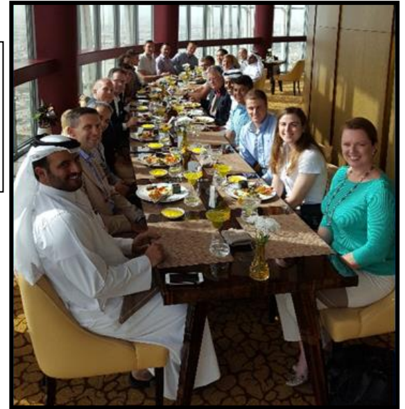
With the goal of increasing knowledge and awareness in the United States about the U.S.-Qatar strategic partnership, the Qatar Military Office in Washington, D.C., partnered with the National Council on U.S.-Arab Relations on a unique initiative for future U.S. military leaders. Four cadets and one History Department escort represented USAFA as part of a larger delegation of cadets from the U.S. military academies invited to visit and explore Qatar, learn about its strategic significance and role in global affairs, and witness firsthand the nature and extent of Qatar-U.S. defense cooperation. The delegation also learned about Qatar's history, culture, and scientific achievements and advances. This delegation of emerging armed forces leaders and strategic thinkers of tomorrow, was hosted by the Qatar Armed Forces from 19 to 26 May 2017, and came away from their visit with a deeper understanding of Qatar's special role in the region and in U.S. military strategy and operations.