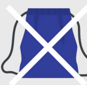
Draw String Bag