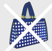
Large Printed Bags