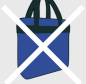
Oversized Tote Bag