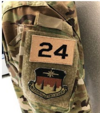
Figure 9.9. Left Arm Patches