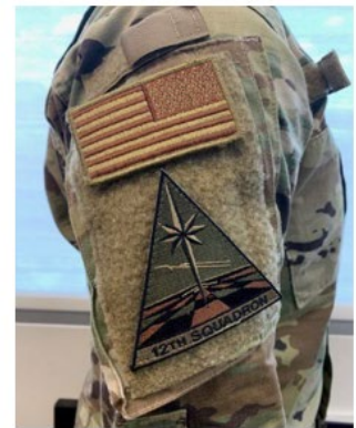
Figure 9.8. Right Arm Patches