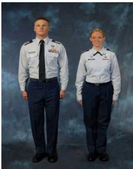
Figure 9.4. Service Uniform.

9.8.12.6.5. Boonie Hat. Only worn as authorized for summer programs in field training areas. May not be worn at any time on the Terrazzo. Use of “shemagh” or field scarf is authorized for wear by Combat Survival Training (CST) and Special Warfare (SW) cadets