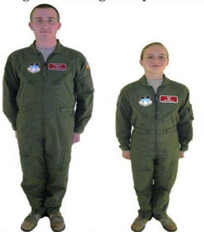
Figure 9.12. PTU.

9.10.1. Fitness Programs. The Directorate of Athletics allows wearing colored shirts with the