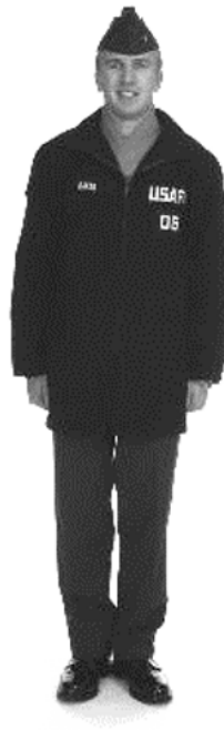
Figure 9.16. Parka