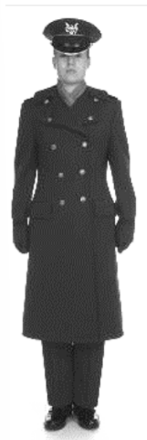
Figure 9.15. Overcoat.