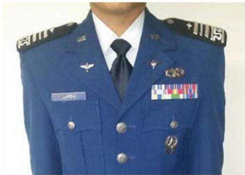
Figure 9.2. Service Dress with P&W