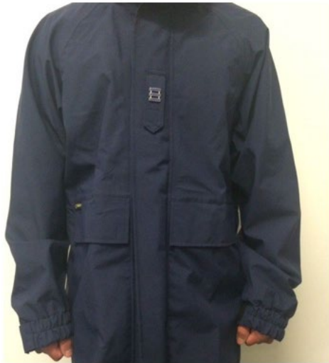
Figure 9.18. Rank on Rain Coat