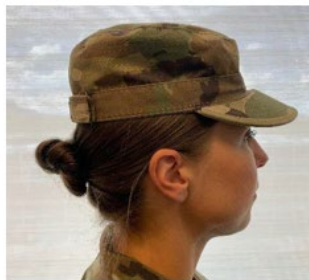
Figure 9.7. Patrol Cap.