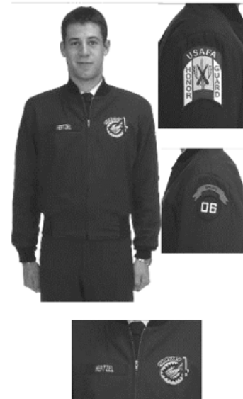
Figure 9.17. Athletic Jacket.