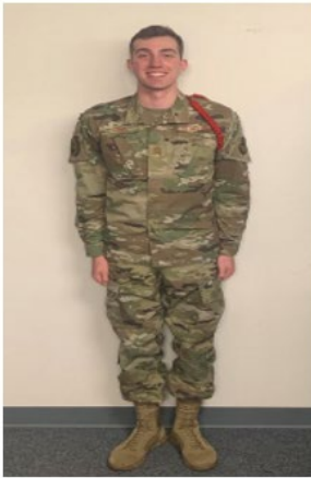
Figure 9.6. OCP Uniform