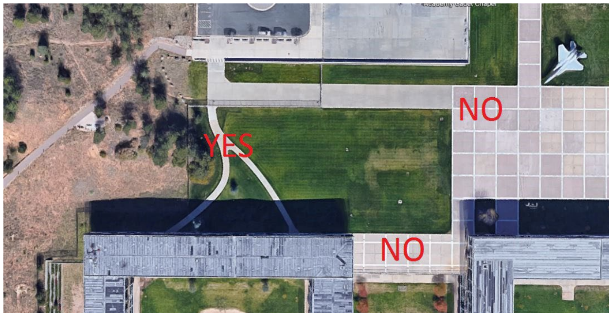
Figure 9.1 Walkway between Sijan Hall and Chapel.

9.1.1.6.1. Cadets may exit from the northwest Sijan Tower in civilian clothes and use the sidewalks to leave the cadet area through the small chapel gate. Reference Figure 9.1.