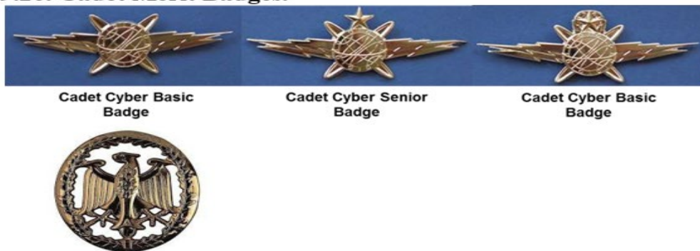
Figure 9.20. Cadet Merit Badges.

9.15.4. Cold weather gear. When required for UOD, will match that worn by the rest of the AFCW with the exception above for OCPs.