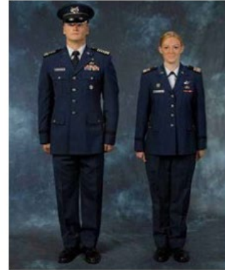
Figure 9.3. Service Dress.

9.8. Service Uniform (Blues). Worn in long and short sleeve variants determined by the Commandant of Cadets.”