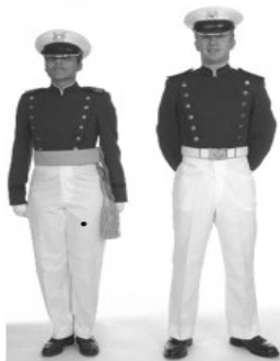
Figure 9.13. Parade Uniform.