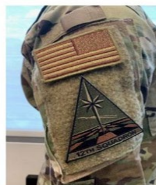
Figure 8.7. Right Arm Patches