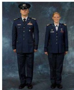
Figure 8.2. Service Dress

8.11 Service Uniform (Class B). Worn in long and short sleeve variants determined by the Commandant of Cadets.