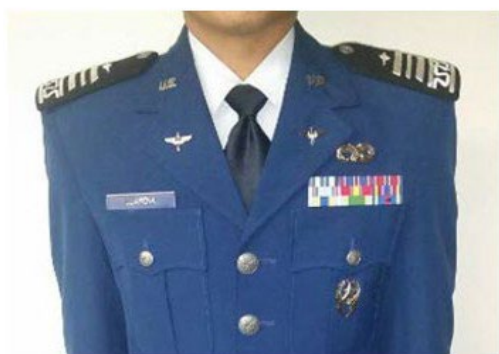
Figure 8.1. Service Dress with P&W