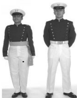
Figure 8.12. Parade Uniform