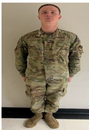
Figure 8.5. OCP Uniform