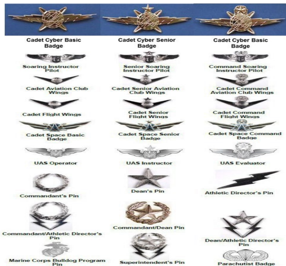
Figure 8.19. Cadet Merit Badges

8.18.4. Cadets will adhere to SPFGM2024-36-01 for the previous modifications.