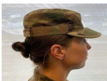
Figure 8.6. Parol Cap