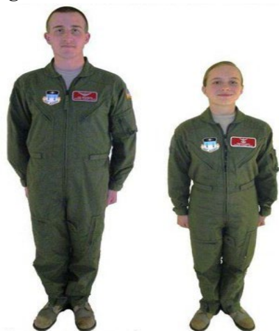
Figure 8.10. FDU