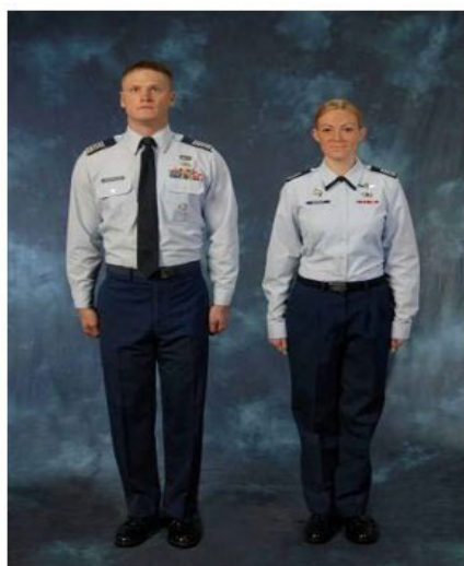
Figure 8.3. Service Uniform