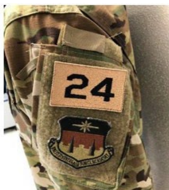
Figure 8.8. Left Arm Patches