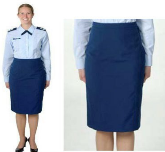
Figure 8.4. Wear of optional Service Uniform Skirt

8.11.9. Operational Camouflage Pattern (OCP). Worn IAW DAFI 36-2903, Dress and Personal Appearance of the United States Air Force and United States Space Force Personnel , with the following provisions for the AFCW: