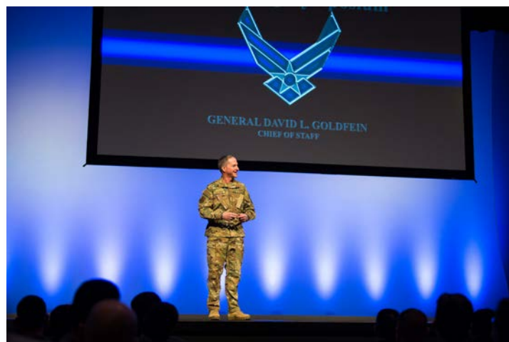
Air Force Chief of Staff Gen. David Goldfein.

Visit www.usafa.edu/academics/facilities/planetarium .